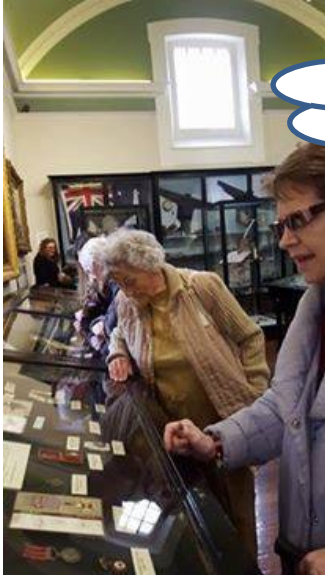
Out and about – Museum, Glenbarr, on the bus and Christmas dinner