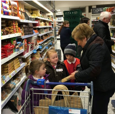
Grammar school pupils with Elderberries visiting for games day at the grammar